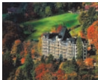
High-end Swiss property development: Du Parc Kempinski in Vaud

"You can't underestimate the stability aspect of Switzerland"