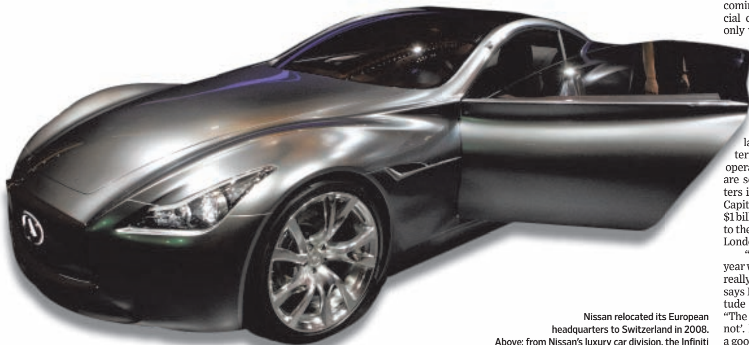
Nissan relocated its European headquarters to Switzerland in 2008. Above: from Nissan's luxury car division, the Infiniti G37 Coupe car at the 79th Geneva Car Show