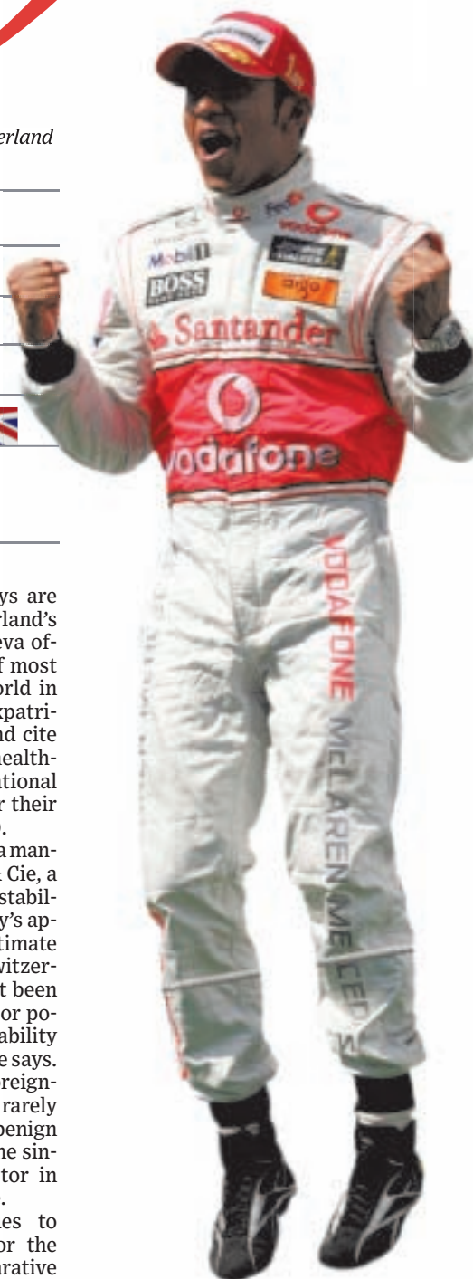
Formula One ace, Lewis Hamilton, moved to Switzerland in 2007

Switzerland continues to offer very low taxes for the wealthy. The comparative appeal of Swiss taxes has started to increase as countries such as the U.K. and